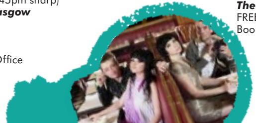
Sons and Daughters

Sat 11, 3pm – 5pm The Steps Theatre, Dundee FREE (Booking essential) Booking: Littlewing 01382 305741