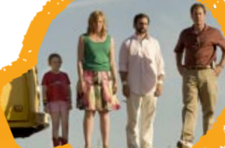
Little Miss Sunshine