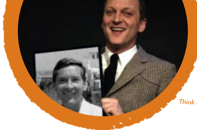
Think No Evil of Us