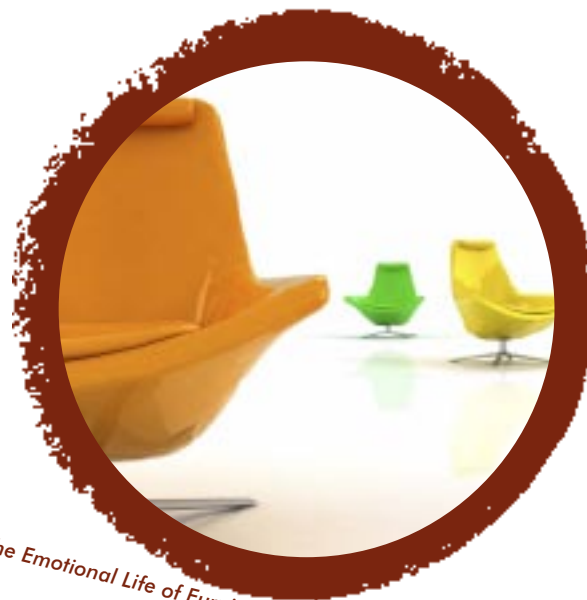
The Emotional Life of Furniture

Reservations: 0141 585 4344, 07886223866