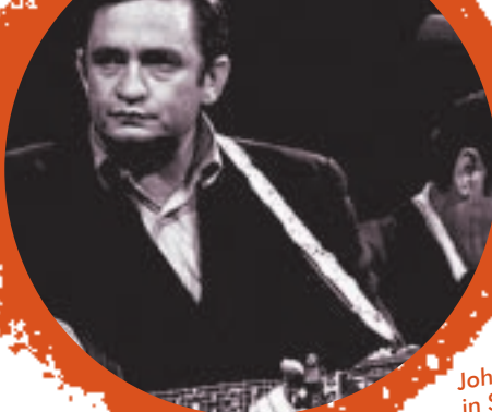
Johnny Cash in San Quentin

Also showing: Vogue Cinema, Lanarkshire, Sun 5, 7pm