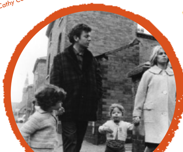
Cathy Come Home