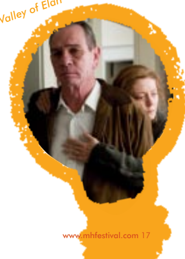
In the Valley of Elah

Also showing: Filmhouse Edinburgh, Mon 6, 5.45pm)